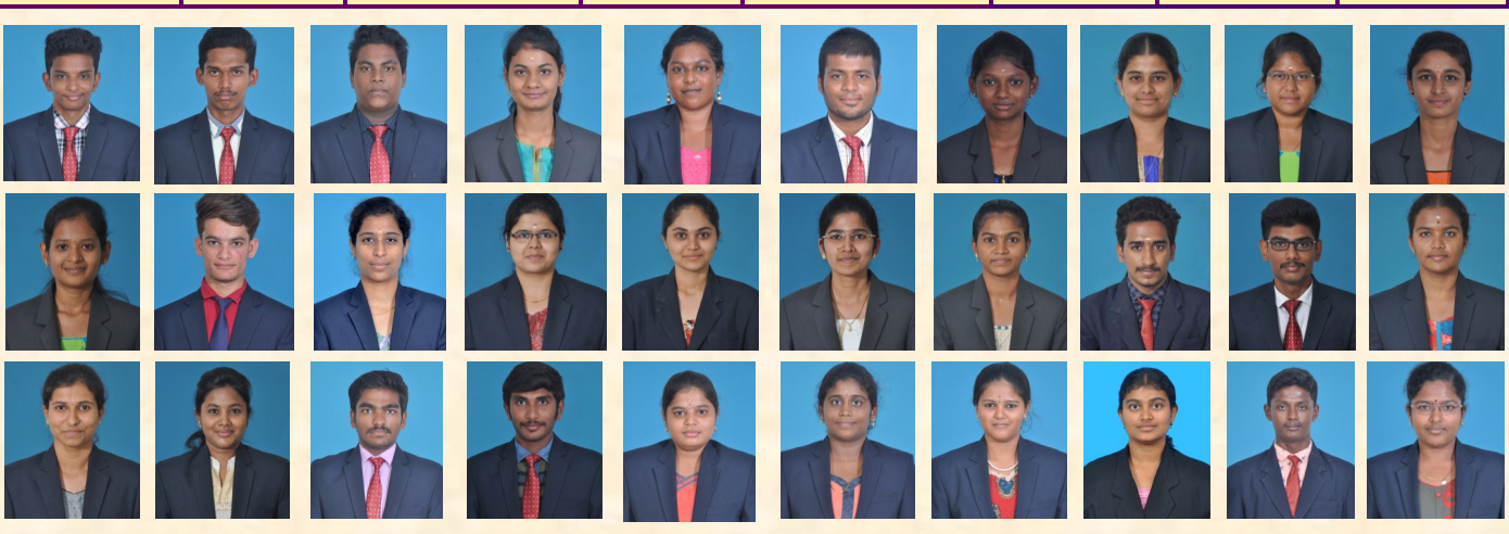
"Software comes from heaven when you have good hardware"