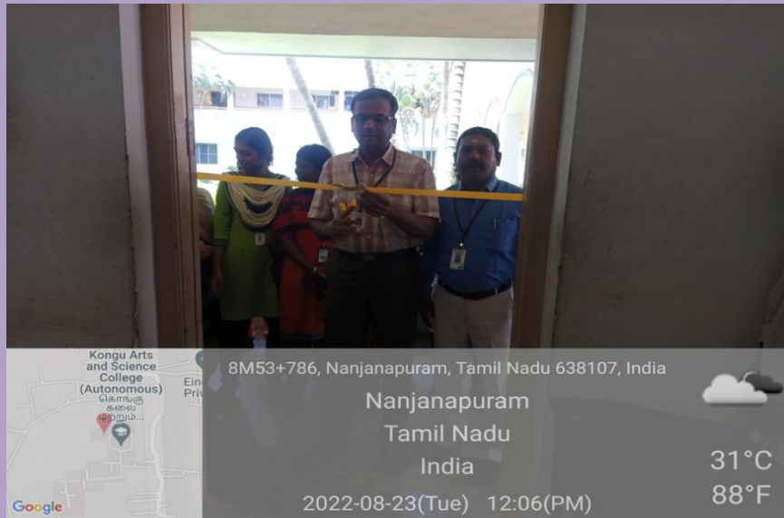
KASC Central Library organized Book Fair on 23.08.2022.