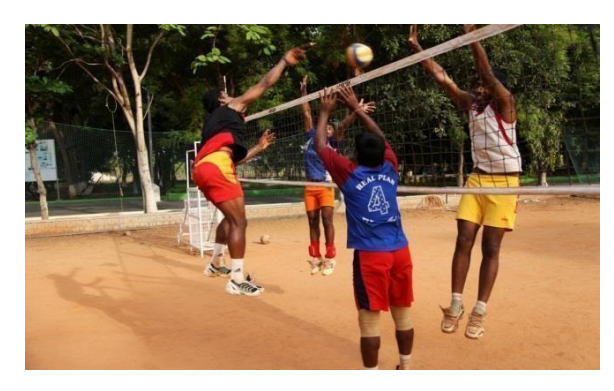
Volley Ball Court