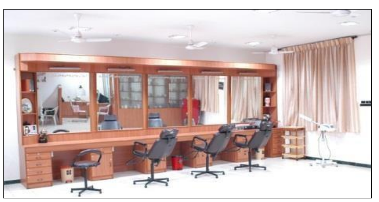
Kongu Beauty Clinic