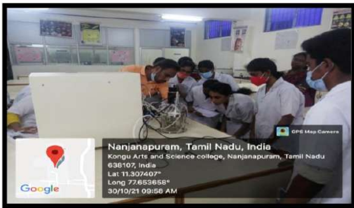
Workshop on ‘Fermentor Handling’