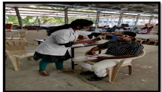
Health Care Camp