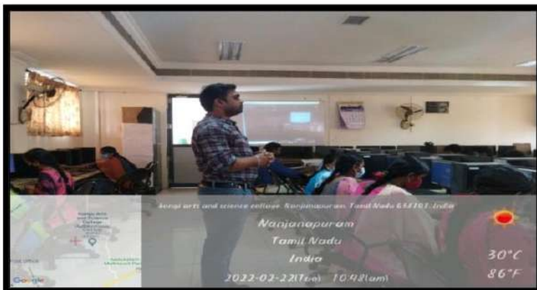
Workshop on ‘Python Programming’