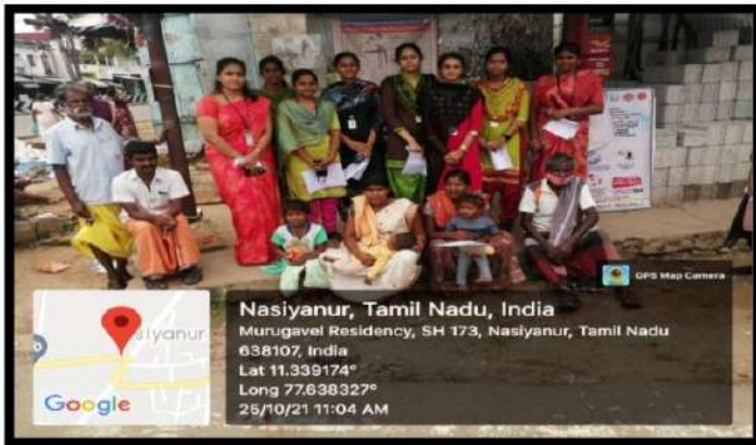
Public awareness program on Breast Cancer Women in Nasiyapur Panchayat Village