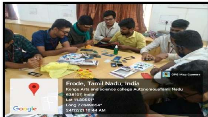
Two Day Skill Development Training on “Functional Components of Mobile Phone”