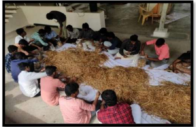
Hands on Workshop on ‘Mushroom Cultivation’