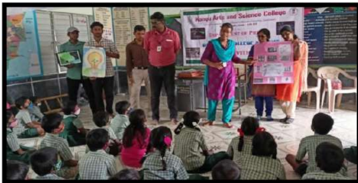
“Energy Conservation by distributing LED bulbs”