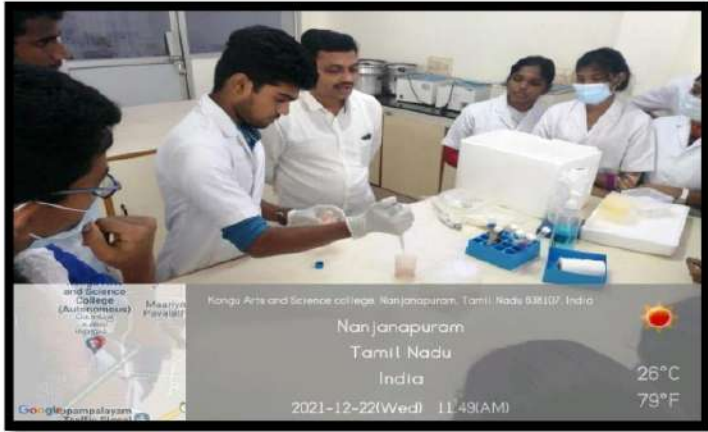
Workshop on “ In vitro Culture of Animal Cells and its Applications