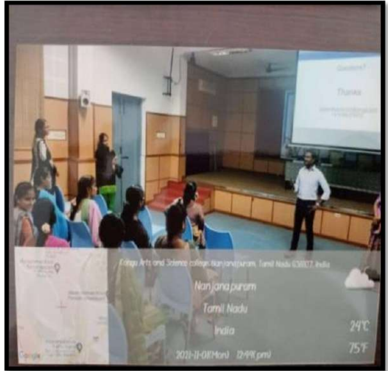
Biochemistry- How it will help in FMCG industry & Pharma job sectors