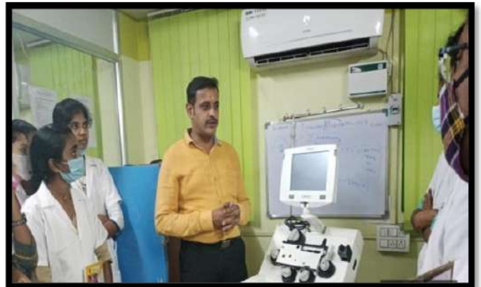
Hands on Workshop on ‘Advanced Immunohematology’