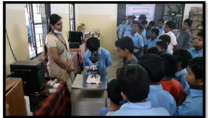
Teaching by Taught – To Infuse Science Temperament among Orphanage Students