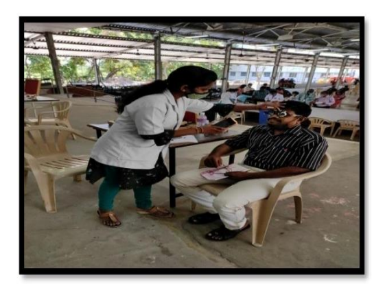
Health Care Camp