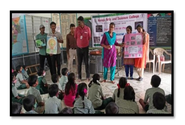
"Energy Conservation by distributing LED bulbs"