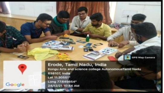
Two Day Skill Development Training on "Functional Components of Mobile Phone"