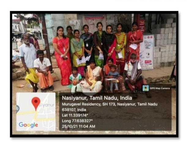
Public awareness program on Breast Cancer Women in Nasiyanur Panchayat Village