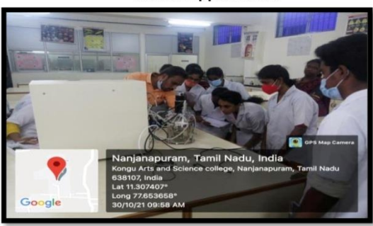
Workshop on 'Fermentor Handling'