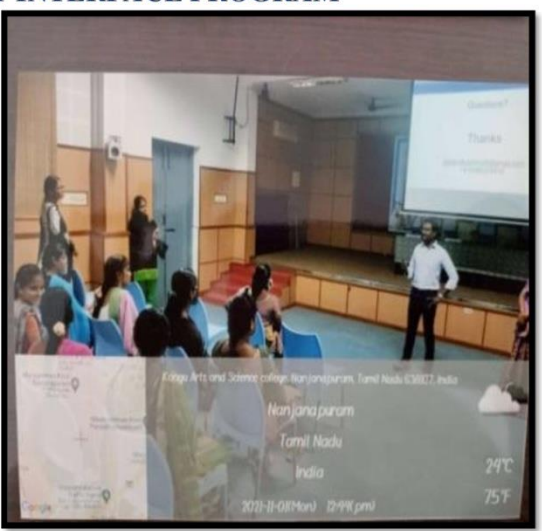
Characterization of Biosimilars using Mass Spectrometry