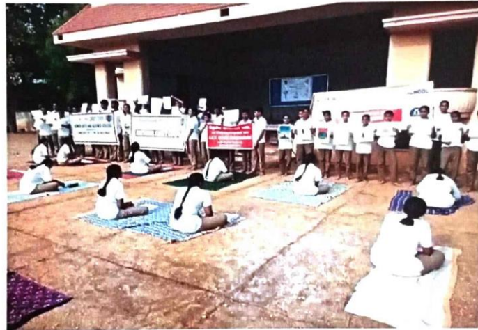
Yoga Awareness - Poster Making and Drawing Competition