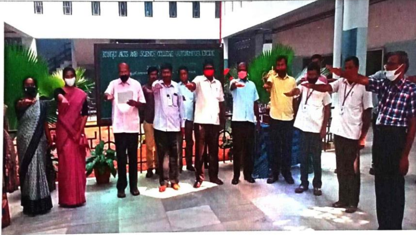
Vigilance Awareness Week pledge