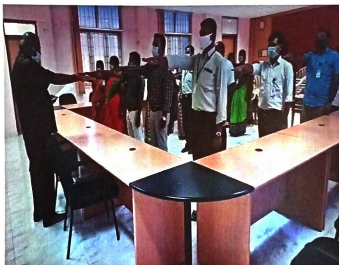
Sadbhavana Diwas – Pledge