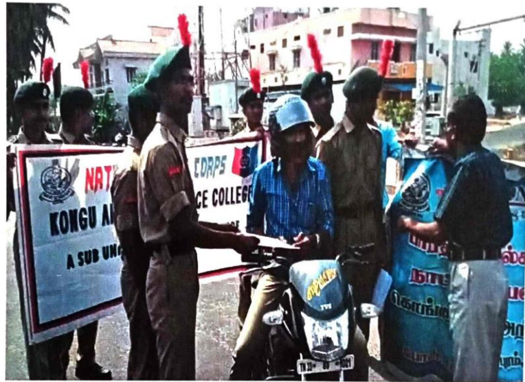
Road safety Awareness Programme

Road safety awareness programme was conducted by National Cadet Corps on 12.04.2017 at Veppampalayam area and also Pamphlets distribution by our NCC Cadets to create awareness among the Public. Totally 20 NCC Cadets took part in the programme