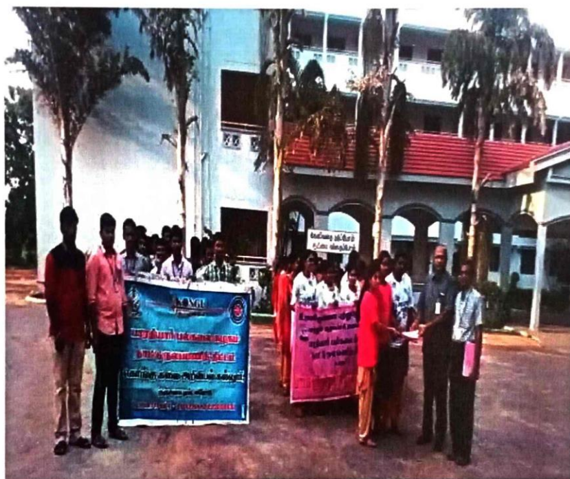
Breast Cancer Awareness Campaign