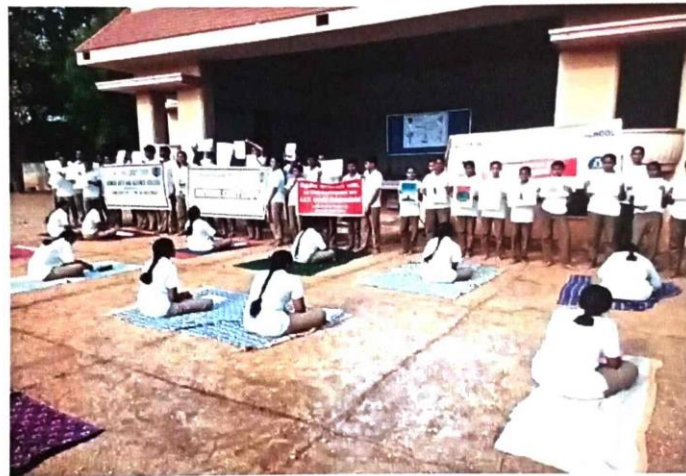
Yoga Awareness - Poster Making and Drawing Competition