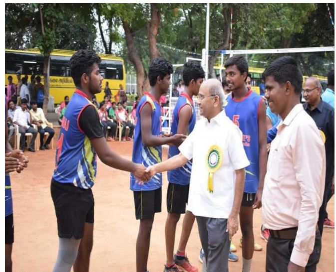
Kongu Trophy: State Level Inter School Tournament