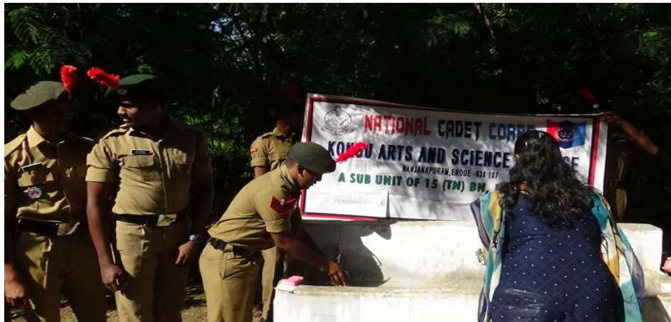
Awareness on Hand wash day

KASC NCC unit was created awareness on Hand wash day on 09.12.2019 at our college premises for NCC Cadets and students. We have explained among the cadets and students about awareness on hygienic. 52 NCC cadets, 50 students and staff has been participated in hand washing programme.