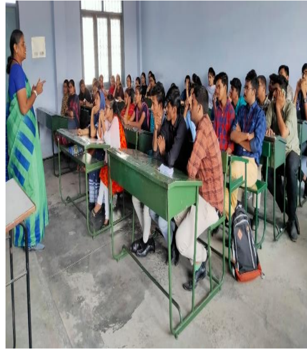
Hindi Sahitya Samiti