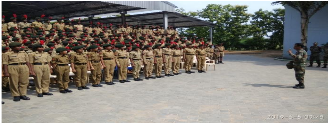
Annual Training Camp cum Republic Day Camp Training & South Zone Shooting Camp

KASC NCC unit was conducted the Combined Annual Training Camp Cum Republic Day Camp Training and South Zone Shooting Camp at Kongu Arts and Science College, Erode from 03.06.2019 to 12.06.2019. 400 NCC cadets and 10 Associate NCC officers from Under Coimbatore groups has been participated in the camp.