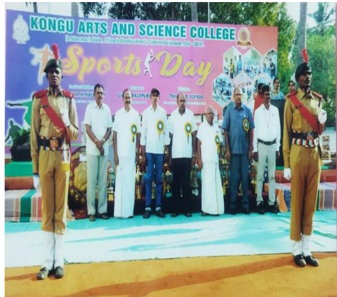
Sports Day - Prize distribution