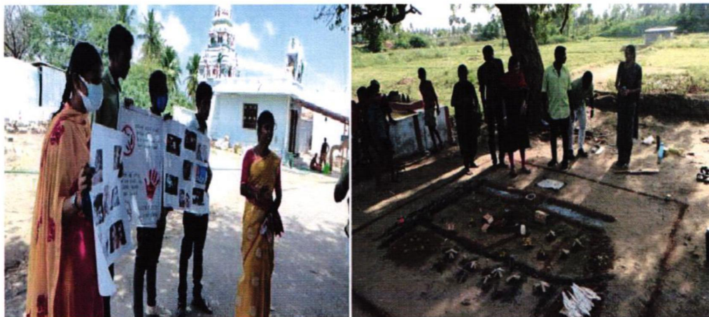
Rural Welfare Camp in Pungampadi village-20.09.2021 to 24.09.2021