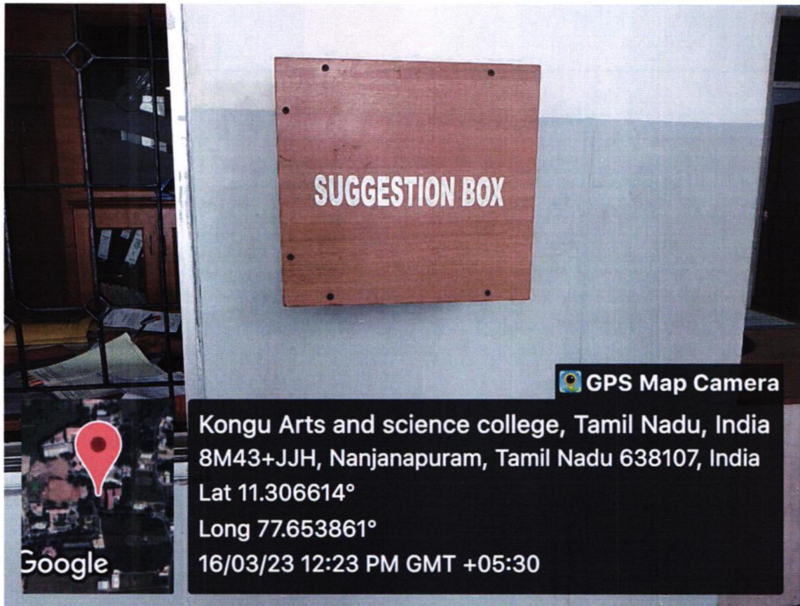
Suggestion Box displayed in Main Block