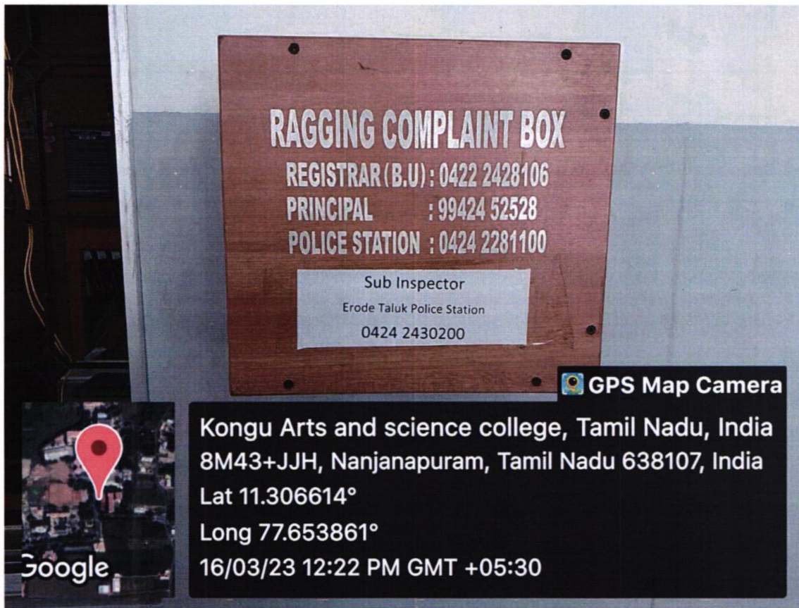
Anti-Ragging complaint Box displayed in Main Block