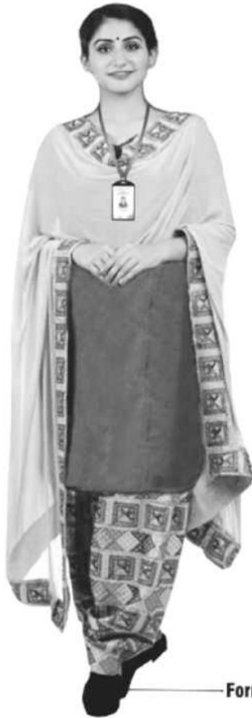
Formal black cut shoes