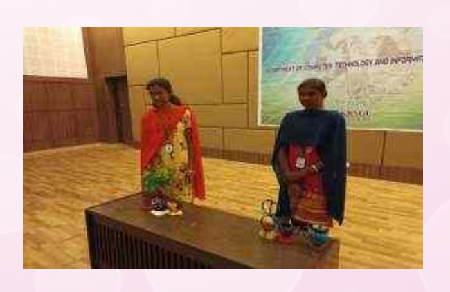
Best out of Waste