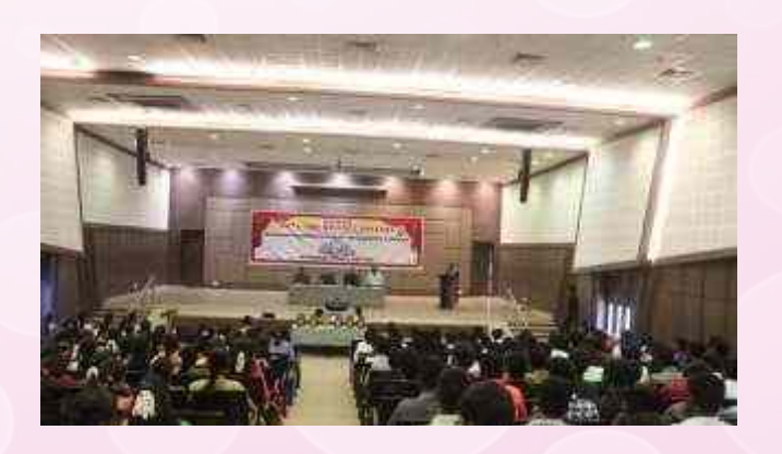
My Story My Content