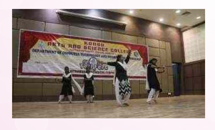
Time to Tap