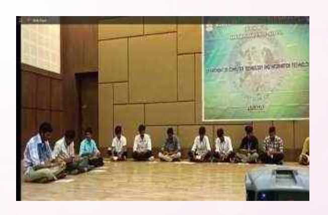
Minute to Win It