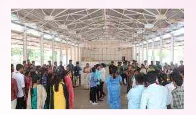
Hunt the Quest