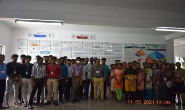
3. Workshop on Intellectual Property Rights on 5/3/21